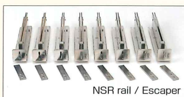
NSR rail / Escaper Optional parts