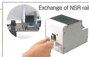
Exchange of NSR rail

To meet the change of the screws, just replace the rail and the escaper. The sticking grease on the rail can be wiped off by pulling it out from the rear side of Quicher. A screw existence signal is attached to the screw pick out section.