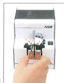
Exchange of NSB rail

It is easy to replace the rail to meet the change of screws.