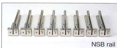
NSB rail Optional parts

The NS series cope with eight different sizes of screws just by replacing the rail (8 sizes from M1.0 to M3.0)